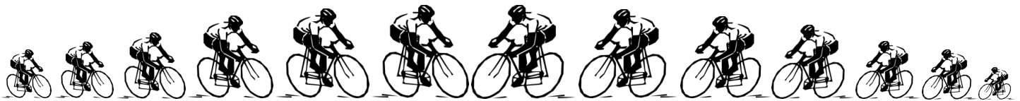
Chrono Strade Bianche/Strade Bianche Road Races —a Prepare For Media production in association with West Michigan Coast Riders. All rights reserved.